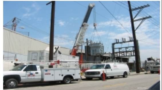
New Year's 2008, a 12kV, 1,000kVA Transformer failed at Los Osos HS; HTE quickly found a stand-in transformer in Bakersfield & used it during failed transformer's winding repair; not a small feat to accomplish!!

Our new Overhead Division spans an entire range of T&D services, including management, administration, inventory control, system evaluation, operations, distribution, transmission, construction, and distribution maintenance. For your T&D needs, think of Hampton Tedder!!