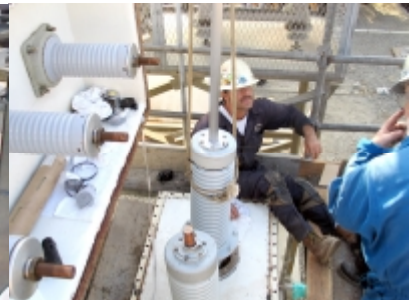
Middle East business was booming and HTE was in the middle of it all.